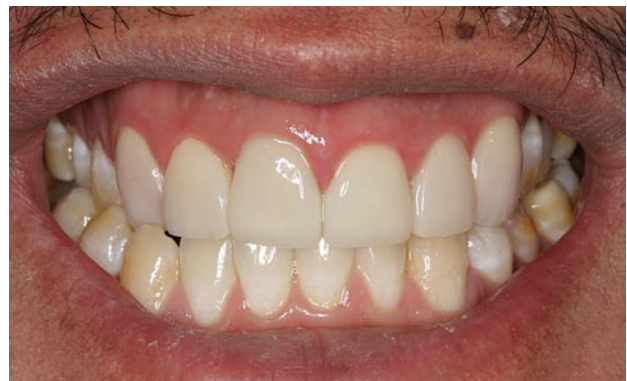
Figure 2 (Amaris veneer-post): Final restoration: Teeth 11 and 21 were endodontically treated and as such were crowned with ceramic crowns. Amaris was used for the layered composite veneers to correct teeth 12, 13 and 22, 23.

sion-resistance and polishability characteristics. The material has a low surface roughness quotient that contributes to the maintenance of lustre over time.