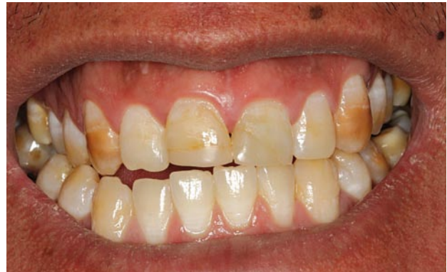
Figure 1 (Amaris veneer-pre): Initial situation: severe tetracycline staining on teeth 11, 12, 13 and 21, 22, 23.

It is well known that certain foods and liquids such as chronic coffee or red wine intake may eventually discolour the superficial layer of composite. Silanization of the filler particles in Amaris minimizes the chance of this happening, as well as improves its physical properties. Transverse strength boasts a high value at 115-120 MPa, compressive strength stands at 367-375 MPa, and diametrical tensile strength is measured at 51 MPa. Polymerization shrinkage is 2%, which is excellent for a material whose physical beauty and lustre is virtually on par with a microfill, whose polymerization shrinkage is typically in the 2.75%+ range. Surface hardness measured on the Micro-Vickers Scale is in the order of 100 units, and features superior surface abra-