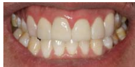
● Final restoration: Teeth 11 and 21 were endodontically treated and as such were crowned with ceramic crowns. Amaris was used for the layered composite veneers to correct teeth 12, 13 and 22, 23.

It is well known that certain foods and liquids such as chronic coffee or red wine intake may eventually discolour the superficial layer of composite. Silanization of the filler particles in Amaris minimises the chance of this happening, and improves its physical properties. Transverse strength boasts a high value at 115-120 MPa, compressive strength stands at 367-375 MPa, and diametrical tensile strength is measured at 51 MPa.