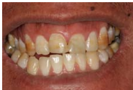
● Initial situation: severe tetracycline staining on teeth 11, 12, 13 and 21, 22, 23.

The new shade guide is simple to use. Coined the 'Intelligent shade concept', the 15 colours were engineered to coincide with the visual parameters of natural tooth colour in CIELAB colour space, with some shades slightly outside this zone to compensate for needing increased opacity to block out the dark shadow of the oral cavity as well as increased translucency to define marked characteristics in a limited volume of placement. Featuring five opaque shades (O1-O5), these essentially replicate dentine shades without having to stock the typical arsenal seen in most practices. The chameleon effect is innate in the