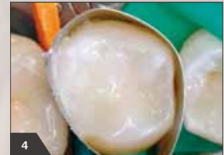
4 Final layer with translucent enamel shade