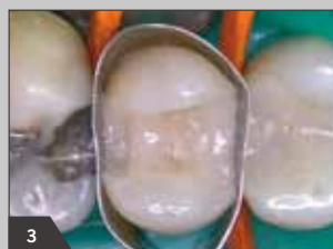
3 Incremental layers of opaque dentine base shade