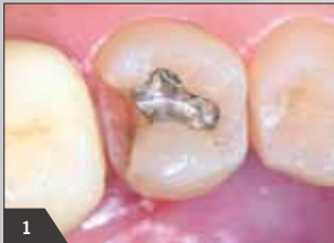
1 Fractured occlusal distal amalgam filling in tooth 45