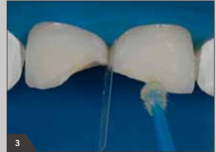
3 Application of the adhesive