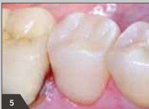
5 Finished, polished restoration (vestibular view)