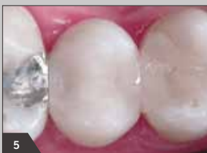
5 Finished, polished restoration