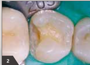
2 Placement of rubber dam and removal of remaining amalgam. Situation after complete excavation