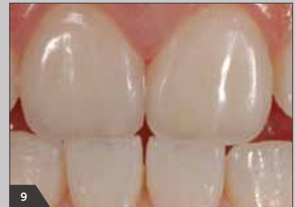
9 Completed anterior restoration