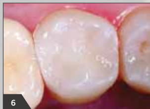
6 Finished restoration from occlusal view