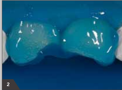
2 Conditioning the tooth substance with 37 % phosphoric acid