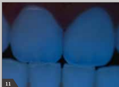
11 Fluorescence like with natural teeth