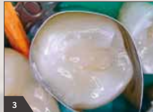
3 Opaque dentine base layer applied in increments