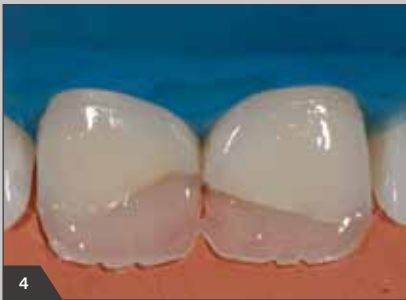
4 Application of Amaris TL to reconstruct the palatal enamel portion