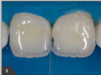
5 Modelling the dentine and mamelons with Amaris O1