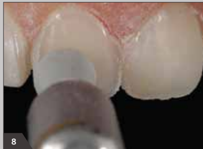
8 High gloss polish of the restoration