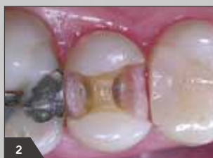
2 Situation after removal of the filling and complete excavation