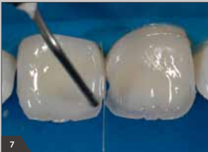
7 Forming the incisal edges with the highly translucent Amaris Flow HT