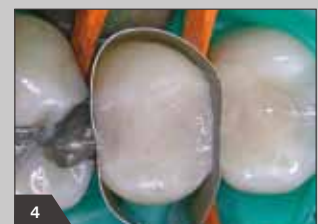
4 Final layer with translucent enamel shade