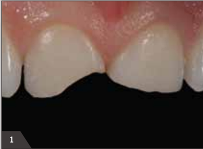
1 Initial situation: incisal fracture in teeth 11 and 21