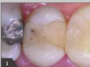
1 Insufficient mod composite restoration in tooth 35