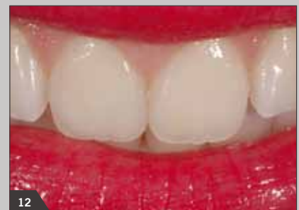
12 Anterior restorations indistinguishable from the natural teeth