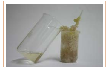
On the right: a resin with 38% micro-filler yields a fissured mass. On the left: the same resin with 40% nano-filler remains a liquid.

A further phenomenon that contributes to aesthetic dental restoratives is the translucency of disperse nano-particles. Since the particles are smaller than the wavelength of visible light, absorption does not occur and light shines through them as it does through glass.